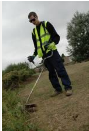
Employment & Skills