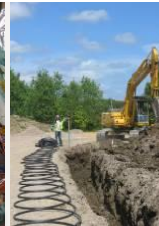
Property & Assets