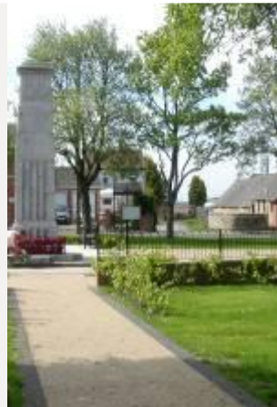
Land & Neighbourhoods