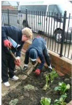
Health & Wellbeing