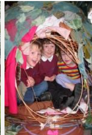
Children & Young People