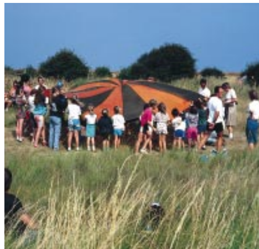
Environmental games.