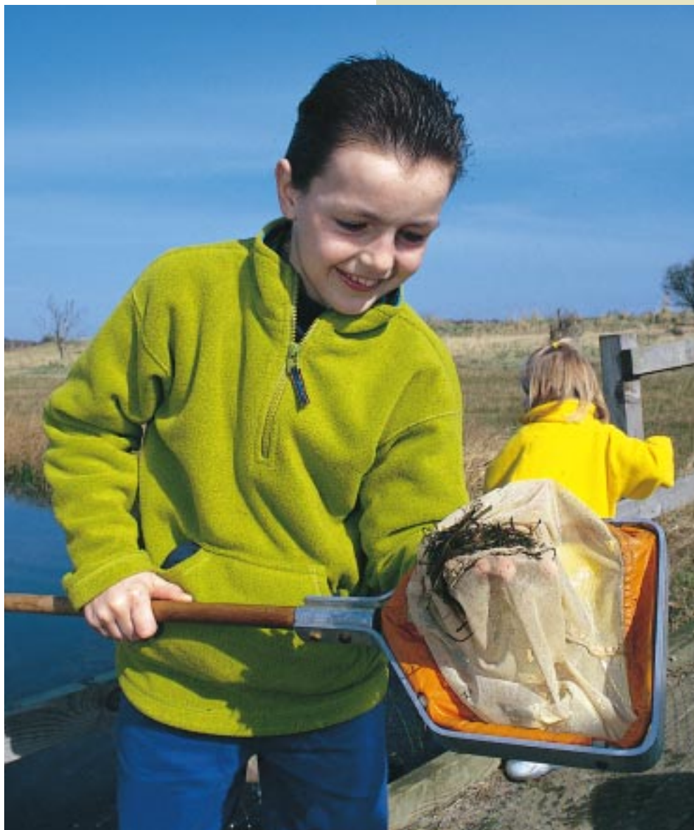
Children pond dipping.

term objectives are. Thought should be given to ways of funding the desired management of the site and what other costs may be involved.