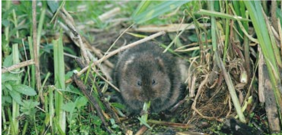
Water vole Arvicola terrestris .