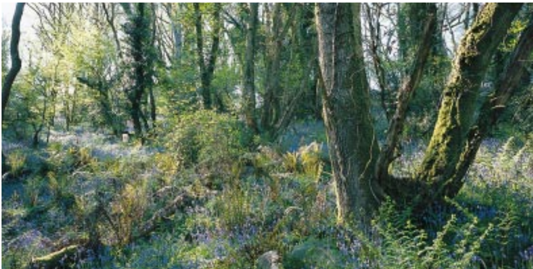
Holyford Woods, 1,000th LNR to be declared.

If a local authority has, or knows of, land which it thinks would make a good LNR, it should contact the appropriate English Nature area team and discuss the proposal informally.