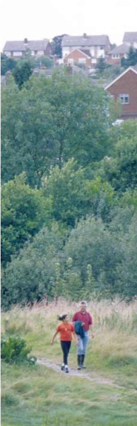
Cotwall End LNR, Dudley.

Ideally, LNRs should be placed in a clear strategic framework for accessible natural greenspace set out in Development Plans, other formal local authority documents and Local Biodiversity Action Plans. They could, for example, be seen as links in green networks which serve a variety of environmental, leisure and transport functions.