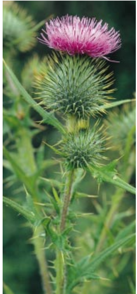
Spear thistle Cirsium vulgare.

This gives time to plan events and carry out initial management and interpretative work.