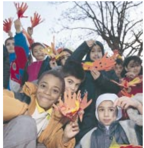
Alsney Park Cemetery LNR, Hackney.

Staff (funded, for example, by the local authority, sponsorship, or through Lottery projects) enable local communities to make the most of their LNRs for both people and wildlife.