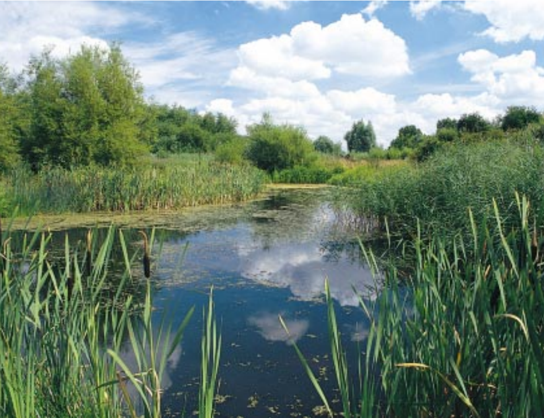
Boardwalks LNR, Cambridgeshire.