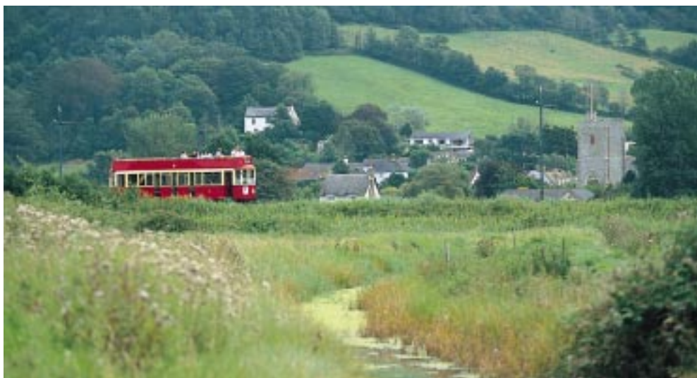
The five-kilometre Seaton Tramway is a fantastic way of watching the birds in places like Seaton Marshes LNR.

might require, and provide help on how to commence the declaration process.