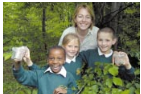
Pupils on a nature walk in Jocks Copse.